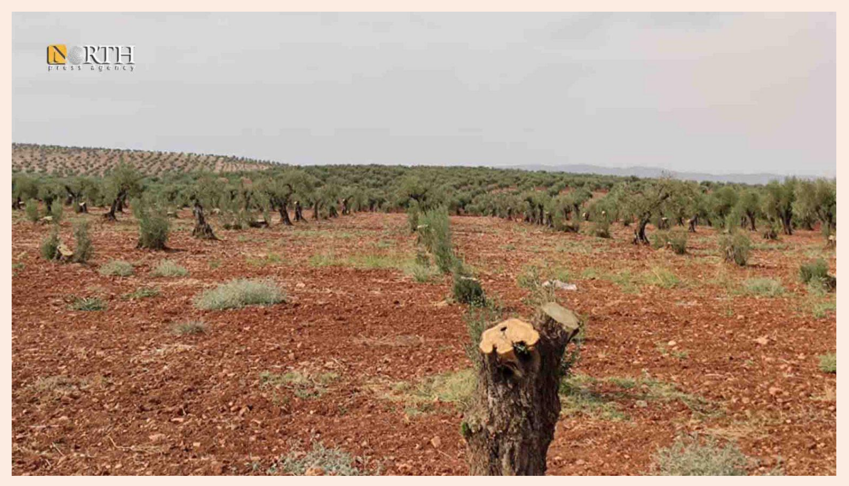
Cutting down olive trees in Jindires district of Afrin (Source: North Press Agency - 24 Oct 2021)